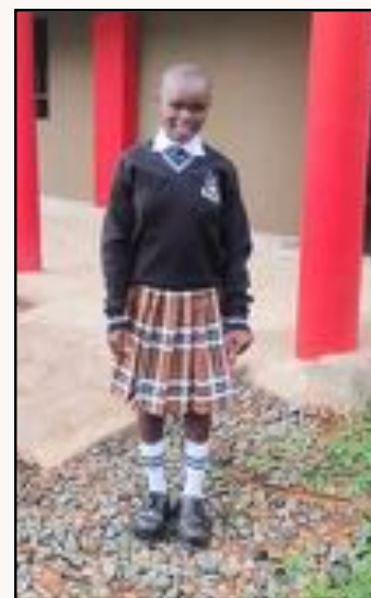
New Bright Spark Academy Uniform

The next steps GHRM is taking to expand Bright Spark Academy include a new curriculum and new amenities. The school looks forward to adding facilities and programs for grades 7, 8, and 9 during 2025, which will allow children to go to school without having to make a 5 km trip. The new curriculum will include farming, vocational, and computer science training. New toilets and showers, as well as teacher's offices.